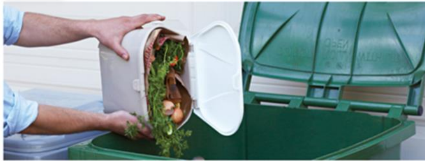
Organic Waste Collection Service